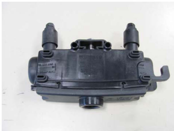
K291 : single pole FSD 100A (22x58)